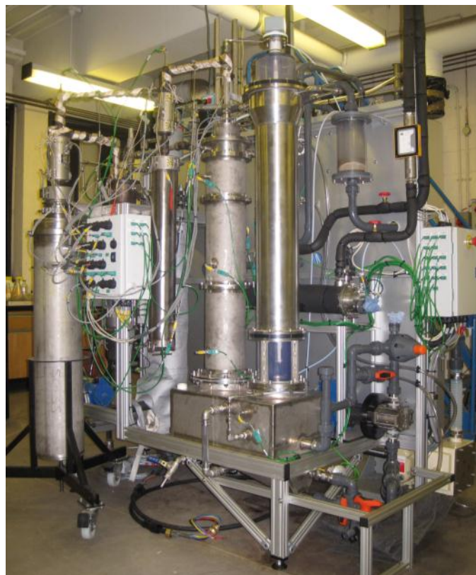
Figure 1: 7 kg/h continuous fast pyrolysis unit.

Aston University's Bioenergy Research Group is a founder member of EBRI .