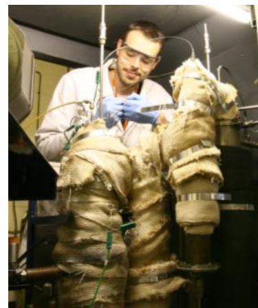
Figure 3: Aston University's nitrogenolysis unit.